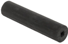
CREMA PRO IN-BENCH REPLACEMENT RUBBER SLEEVE