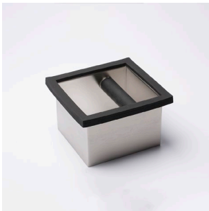
CREMA PRO SQUARE WASTE CHUTE