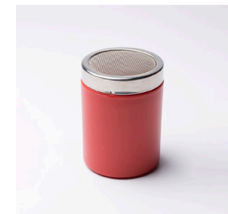
CREMA PRO CHOCOLATE / CINNAMON SHAKER