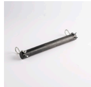
CREMA PRO COMMERCIAL REPLACEMENT KNOCK BAR