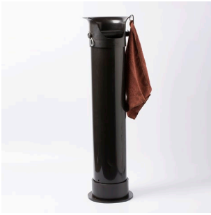
CREMA PRO COMMERCIAL WASTE TUBE