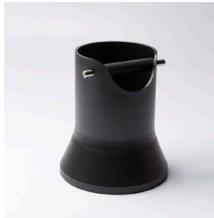
CREMA PRO DOMESTIC MEDIUM WASTE BIN