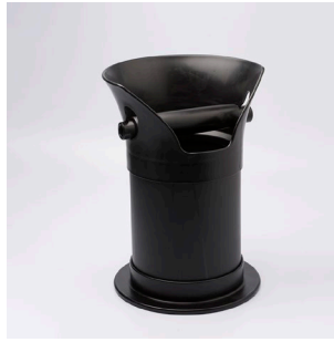
CREMA PRO BENCH COMMERCIAL WASTE TUBE