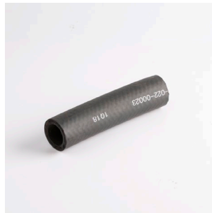
CREMA PRO COMMERCIAL REPLACEMENT RUBBER SLEEVE