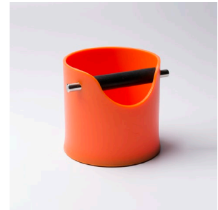
CREMA PRO DOMESTIC SMALL WASTE BIN

SKU 40CPMKBB Black 40CPMKBG Grey 40CPMKBR Red 40CPMKBO Orange