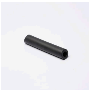
CREMA PRO DOMESTIC REPLACEMENT RUBBER SLEEVE

SKU 40CPSKBB Black 40CPSKBG Grey 40CPSKBR Red 40CPSKBO Orange