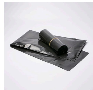
BARISTA ACE COMMERCIAL WASTE LINERS